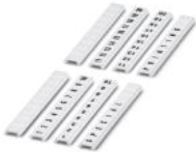
Zack marker strip flat, 10-section, horizontally labeled with the consecutive even numbers: 2 ... 20, white

Please be informed that the data shown in this PDF Document is generated from our Online Catalog. Please find the complete data in the user's documentation. Our General Terms of Use for Downloads are valid ( http://phoenixcontact.com/download )