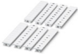
Zack marker strip, 10-section, horizontally labeled with the consecutive numbers: 11 ... 20, white, width: 5 mm

Please be informed that the data shown in this PDF Document is generated from our Online Catalog. Please find the complete data in the user's documentation. Our General Terms of Use for Downloads are valid ( http://phoenixcontact.com/download )