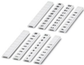
Zack marker strip flat, 10-section, horizontally labeled with the consecutive numbers: 91 ... 100, white

Please be informed that the data shown in this PDF Document is generated from our Online Catalog. Please find the complete data in the user's documentation. Our General Terms of Use for Downloads are valid ( http://phoenixcontact.com/download )