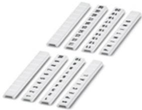
Zack marker strip flat, 10-section, horizontally labeled with the consecutive numbers: 81 ... 90, white

Please be informed that the data shown in this PDF Document is generated from our Online Catalog. Please find the complete data in the user's documentation. Our General Terms of Use for Downloads are valid ( http://phoenixcontact.com/download )