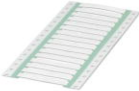
The illustration shows WMS 6,4 (30X10)R

Shrink sleeve, Roll, white, unlabeled, can be labeled with: THERMOMARK W, THERMOMARK ROLL, THERMOMARK X1.2, THERMOMARK ROLL X1, perforated, Lettering field: 30 x 20 mm