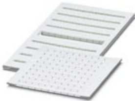
Zack marker sheet flat, 100-section, horizontally labeled with the consecutive numbers: 31 ... 40, 10 identically labeled strips per flat Zack marker sheet, suitable for all terminal blocks with 4.2 mm pitch, white

Please be informed that the data shown in this PDF Document is generated from our Online Catalog. Please find the complete data in the user's documentation. Our General Terms of Use for Downloads are valid ( http://phoenixcontact.com/download )