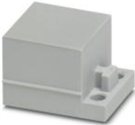
Small blind sleeve, material: SEBS

Please be informed that the data shown in this PDF Document is generated from our Online Catalog. Please find the complete data in the user's documentation. Our General Terms of Use for Downloads are valid ( http://phoenixcontact.com/download )