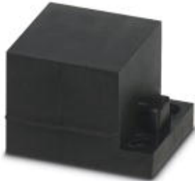
Small blind sleeve, material: NBR

Please be informed that the data shown in this PDF Document is generated from our Online Catalog. Please find the complete data in the user's documentation. Our General Terms of Use for Downloads are valid ( http://phoenixcontact.com/download )