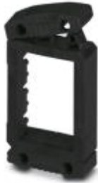
Sealing frame with locking latch, size B10, with flat gasket, for 6 small sleeves

Please be informed that the data shown in this PDF Document is generated from our Online Catalog. Please find the complete data in the user's documentation. Our General Terms of Use for Downloads are valid ( http://phoenixcontact.com/download )