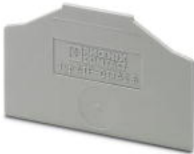
Partition plate, length: 55.7 mm, width: 1.5 mm, height: 34.3 mm, color: gray

Please be informed that the data shown in this PDF Document is generated from our Online Catalog. Please find the complete data in the user's documentation. Our General Terms of Use for Downloads are valid ( http://phoenixcontact.com/download )