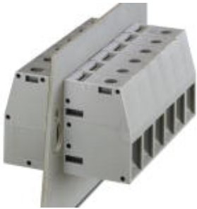
The illustration shows version HDFK 50 in gray

Please be informed that the data shown in this PDF Document is generated from our Online Catalog. Please find the complete data in the user's documentation. Our General Terms of Use for Downloads are valid ( http://phoenixcontact.com/download )