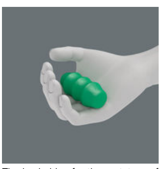
The basic idea for the prototype of the Kraftform handle - that the hand should dictate the design has, right through to today, proved to be correct. In cooperation with the internationally recognised Fraunhofer IAO Institute, Wera developed a screwdriver handle designed to match the shape of the human hand as long ago as the 1960s. After a long development phase, the Wera Kraftform handle was launched to the market in 1968. It has been optimised through the years with new technologies, but has kept its proven shape. After all, the human hand has not changed either.