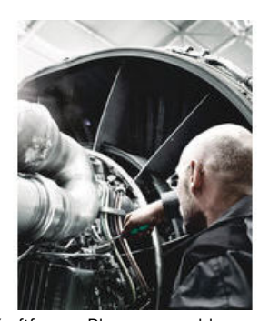
Kraftform Plus screwdrivers – ergonomics you can grasp. They relieve the entire hand-arm system even when used intensively. Along with other technical and product advantages such as the Lasertip for a secure fit in the screw head, Kraftform screwdrivers are the ideal choice whenever manual screwdriving jobs are concerned.