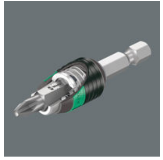
Rapid bit change without needing any additional tools. One-hand operation with a freely spinning sleeve for simplified guidance of the tool. Also available in a BiTorsion design.

service Even the life of conventional bits is enhanced with the use of the BiTorsion holder and the BiTorsion bit also functions in a normal holder.