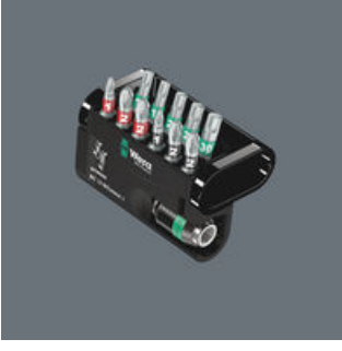
The Bit-Checks can be positioned upright at the workplace so the tool is always quickly to hand.