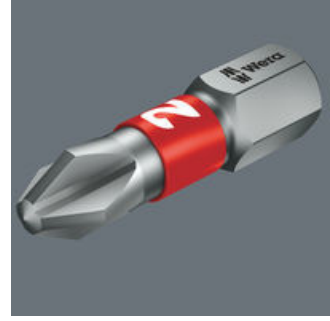
BiTorsion bits are absolutely premium products. They have a softer BiTorsion zone which reduces the hardness of the shaft by about 20 % in comparison to the drive tip. This means that the peak loads that cause bit breakage and premature wear are absorbed in this zone - something which enhances the service life of the bits.