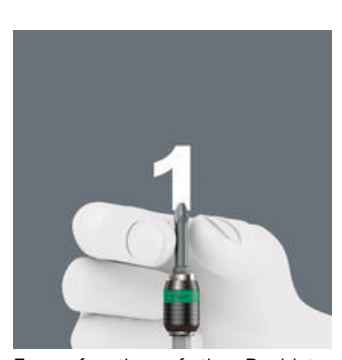
Every function of the Rapidator quick-release chuck, such as inserting or releasing bits, can be carried out with one hand. This is faster, more economical and more ergonomic. There are no unnecessary manoeuvres.