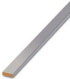
PEN conductor busbar, 3mm x 10 mm, length: 1000 mm

Please be informed that the data shown in this PDF Document is generated from our Online Catalog. Please find the complete data in the user's documentation. Our General Terms of Use for Downloads are valid ( http://phoenixcontact.com/download )