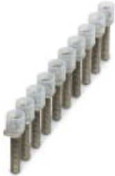
Jumper, pitch: 10 mm, number of positions: 10, color: silver

Please be informed that the data shown in this PDF Document is generated from our Online Catalog. Please find the complete data in the user's documentation. Our General Terms of Use for Downloads are valid ( http://phoenixcontact.com/download )