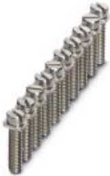
Jumper, Number of positions: 10, Color: silver

Please be informed that the data shown in this PDF Document is generated from our Online Catalog. Please find the complete data in the user's documentation. Our General Terms of Use for Downloads are valid ( http://phoenixcontact.com/download )