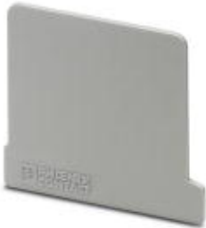
End cover, Length: 42.5 mm, Width: 1.3 mm, Color: gray

Please be informed that the data shown in this PDF Document is generated from our Online Catalog. Please find the complete data in the user's documentation. Our General Terms of Use for Downloads are valid ( http://phoenixcontact.com/download )