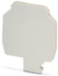
End cover, insulation material: ceramic

Please be informed that the data shown in this PDF Document is generated from our Online Catalog. Please find the complete data in the user's documentation. Our General Terms of Use for Downloads are valid ( http://phoenixcontact.com/download )