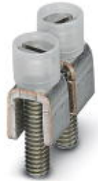
Fixed bridge, pitch: 10 mm, number of positions: 2, color: silver

Please be informed that the data shown in this PDF Document is generated from our Online Catalog. Please find the complete data in the user's documentation. Our General Terms of Use for Downloads are valid ( http://phoenixcontact.com/download )