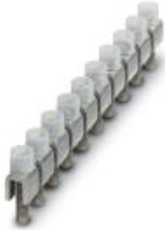
Fixed bridge, pitch: 12 mm, length: 7.5 mm, width: 118.4 mm, number of positions: 10, color: silver

Please be informed that the data shown in this PDF Document is generated from our Online Catalog. Please find the complete data in the user's documentation. Our General Terms of Use for Downloads are valid ( http://phoenixcontact.com/download )