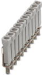
Jumper, Number of positions: 10, Color: gray

Please be informed that the data shown in this PDF Document is generated from our Online Catalog. Please find the complete data in the user's documentation. Our General Terms of Use for Downloads are valid ( http://phoenixcontact.com/download )