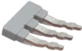
Insertion bridge, Pitch: 8 mm, Number of positions: 3, Color: gray

Please be informed that the data shown in this PDF Document is generated from our Online Catalog. Please find the complete data in the user's documentation. Our General Terms of Use for Downloads are valid ( http://phoenixcontact.com/download )