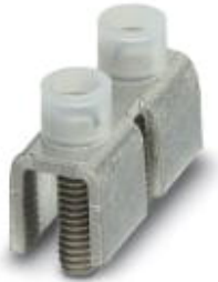
Fixed bridge, Number of positions: 2, Color: silver

Please be informed that the data shown in this PDF Document is generated from our Online Catalog. Please find the complete data in the user's documentation. Our General Terms of Use for Downloads are valid ( http://phoenixcontact.com/download )