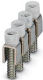
Fixed bridge, pitch: 8 mm, number of positions: 4, color: silver

Please be informed that the data shown in this PDF Document is generated from our Online Catalog. Please find the complete data in the user's documentation. Our General Terms of Use for Downloads are valid ( http://phoenixcontact.com/download )