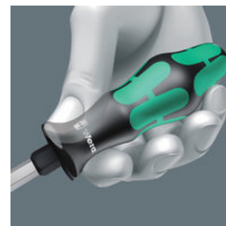
The outstanding design of the Kraftform handle that fits perfectly into the hand prevents hand injuries such as blisters and calluses.