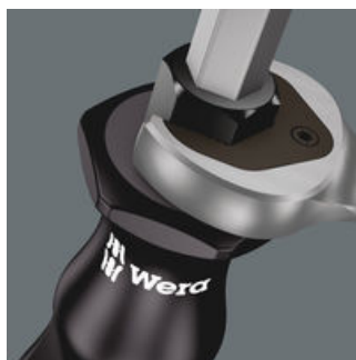
Hexagonal blade and bolster for higher torque transfer.