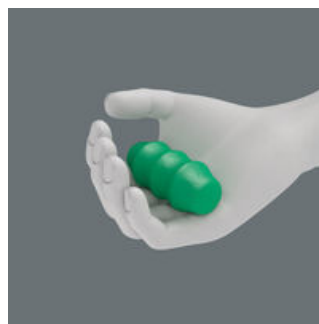
The basic idea for the prototype of the Kraftform handle – that the hand should dictate the design – has, right through to today, proved to be correct. In cooperation with the internationally recognised Fraunhofer IAO Institute, Wera developed a screwdriver handle designed to match the shape of the human hand as long ago as the 1960s. After a long development phase, the Wera Kraftform handle was launched to the market in 1968. It has been optimised through the years with new technologies, but has kept its proven shape. After all, the human hand has not changed either.