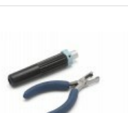
CLEANING TOOL WXDP/DSX 120