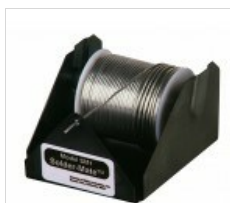
SOLDER MATE SOLDER DISPENSER 1LB SOLDER SM1