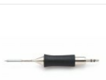
FINE POINT Cartridge, RT2MS, 0.8MM