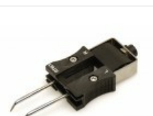
RTW 1 SLD TIP SET 0,2MM, WMRT