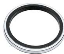
Metal Clad Sealing O-Rings