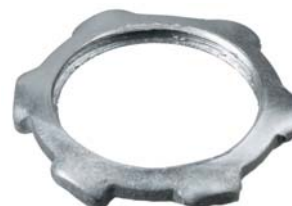
Zinc-Plated Steel Locknuts

Notes: Catalog numbers above with "PK50" suffix, i.e. 00322001LPK50, are bulk packed 50 per carton. See page T-96 for additional technical data and dimensional drawings.